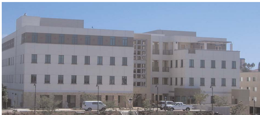
Calpulli Center, the new Student Health Services facility, sits prominently on campus

with its consultation windows now much further away from the checkout counter. Furthermore, the pharmacy has been upgraded from little more than a window display with a cash register to a