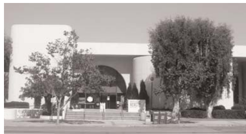
Old Student Health Services Building

What all these improvements will mean for the prehealth students at SDSU is still not com-