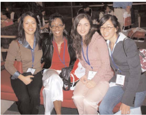
Predental Students chat with a UCSF Admissions Officer at the opening Dinner

increasing rates of Human Papilloma Virus. Many other workshops and lectures, a total of twenty, including Nutrition and Medicine, Public Health in International Settings, Personal Statement Writing, Mock Interviews, and Osteopathic Medical Manipulation