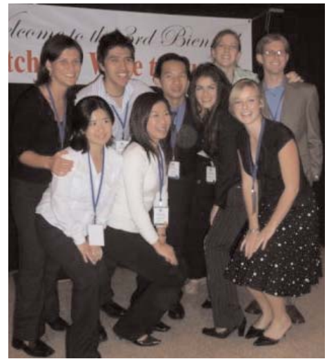
Some of CPO’s Executive Officers and Club Representatives

third conference outdid its predecessors, and we look forward to seeing what comes in 2007 at the fourth Catch the Wave conference.