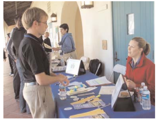
Students speak to Admissions Officers at the College Fair

I’ll do my best to keep the newsletter running with updates from alumni and updates on what is going on at SDSU’s prehealth clubs. Hopefully we’ll have 1-2 newsletters each year. If I ever figure out how to do anything more than turn