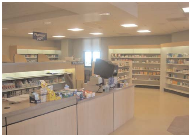
The new Pharmacy now has shelf space for over-the-counter drugs and medical supplies

Send me your updates at djeffrey@hotmail.com