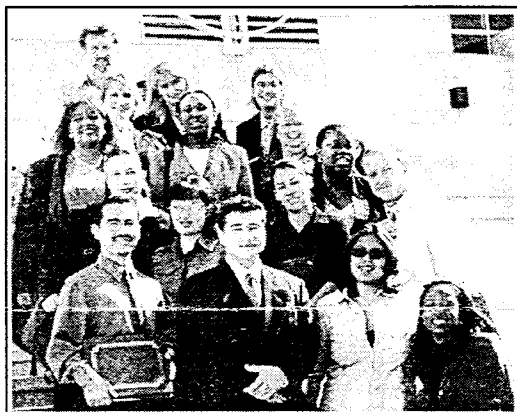
SDSU McNair Scholars at UCSD Summer Research Conference.