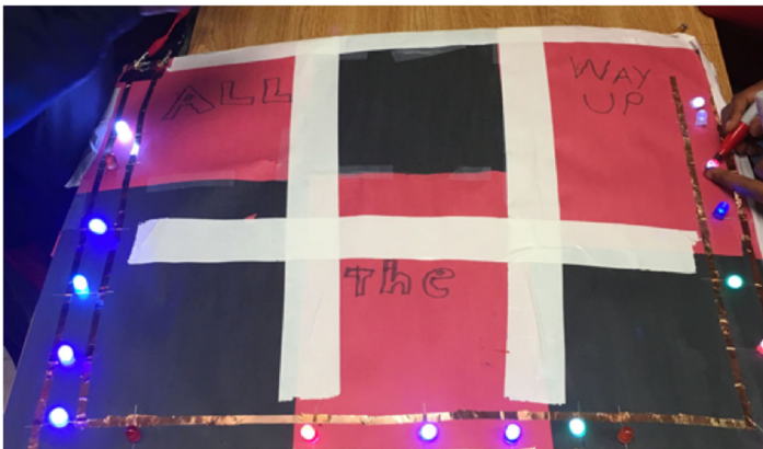
FIGURE 2 All the Way Up Accomplishment Board [Color figure can be viewed at wileyonlinelibrary.com ]