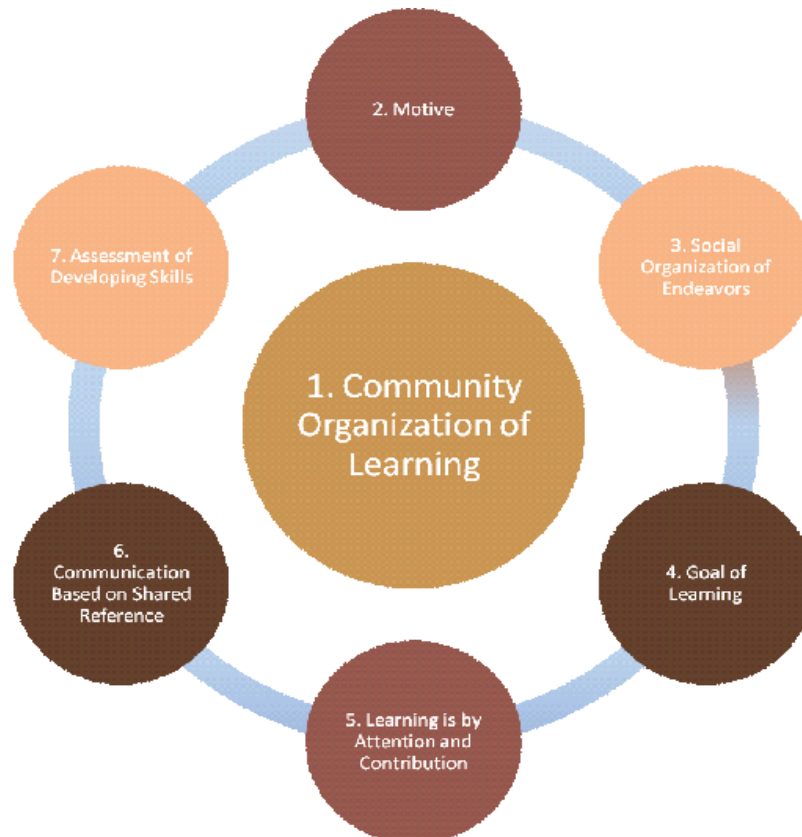
Figure 1 Features of Rogoff’s (2014) Learning by Observation and Pitching in

Rogoff’s theory has been most recently applied to the study of culturally relevant contexts, such as learning processes of Mexican children (Alcalá, Rogoff, Mejía-Arauz, Coppens, & Dexter, 2014; Coppens, Alcalá, Mejía-Arauz, & Rogoff, 2014), classroom management in bilingual classes (Paradise, Mejía-Arauz, Silva, Dexter, & Rogoff, 2014), mentoring program for college students (Frahm et al., 2013), and motivation of young athletes (Rogoff, 2011). The apprenticeship model is ripe with opportunities for applications to the field of teacher education in general and student